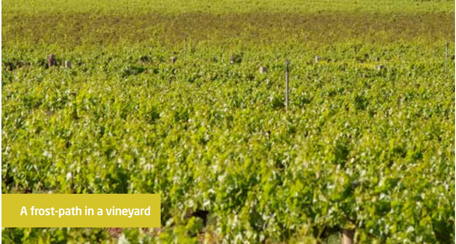
A frost-path in a vineyard

Remember to be a good neighbour - your vineyard management practices in spring not only affect your property, but also, potentially, your neighbours'. So do not undertake management practices that will induce frost. Cold air (and thus frost) wherever it is induced, will move to the lowest spot, and this may be your neighbours'. For example, premature working up of the soil may cause pockets of cold air to form on your property, and these may flow on to your neighbours' land.