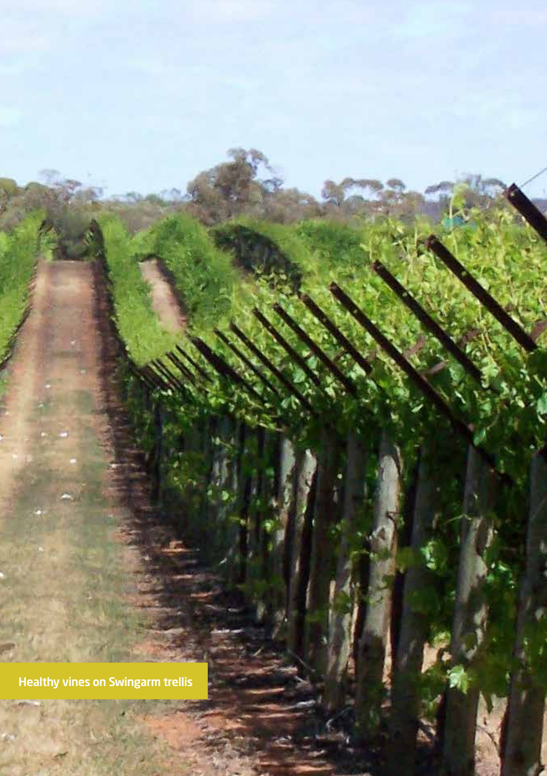
Healthy vines on Swingarm trellis