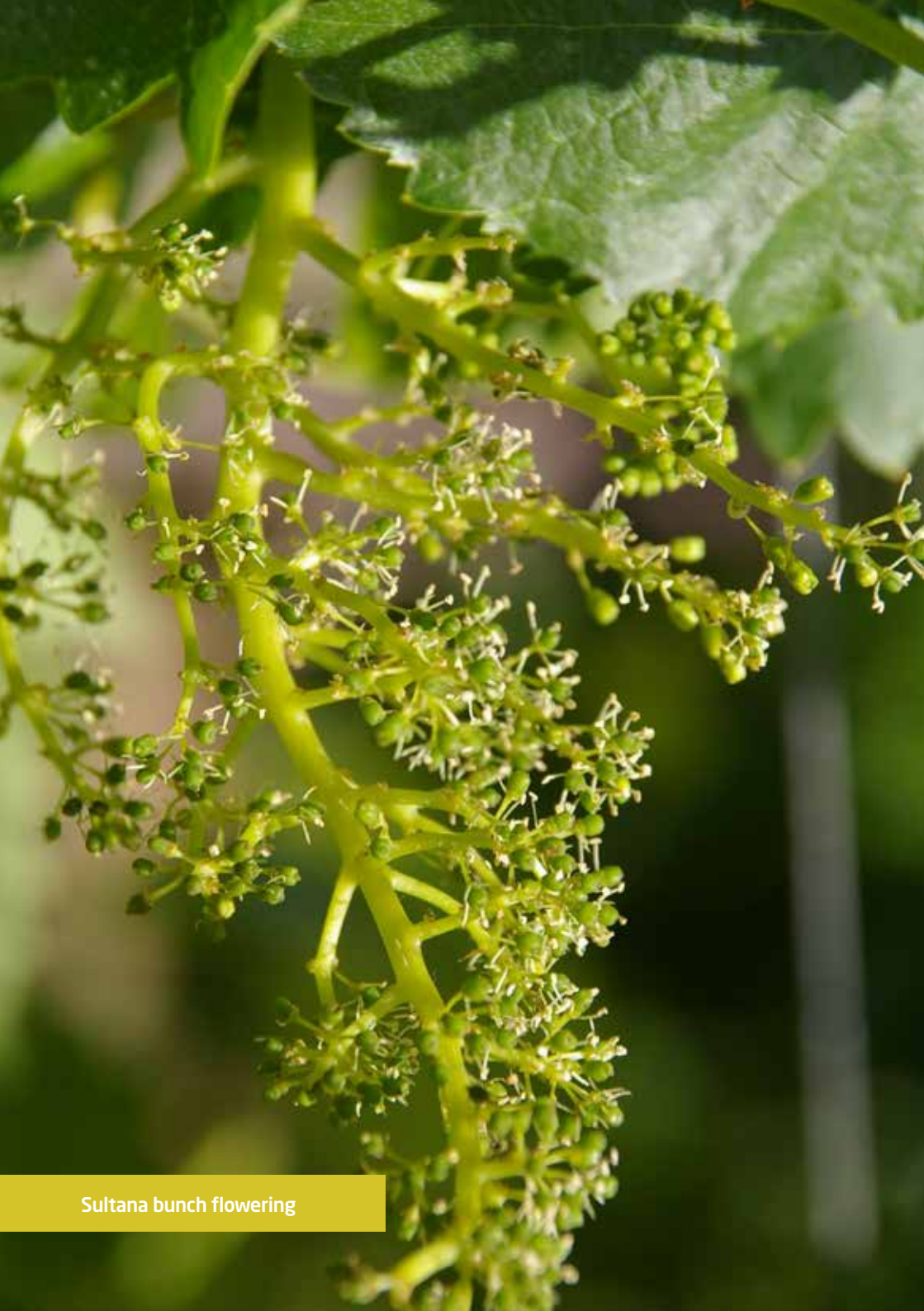
Sultana bunch flowering