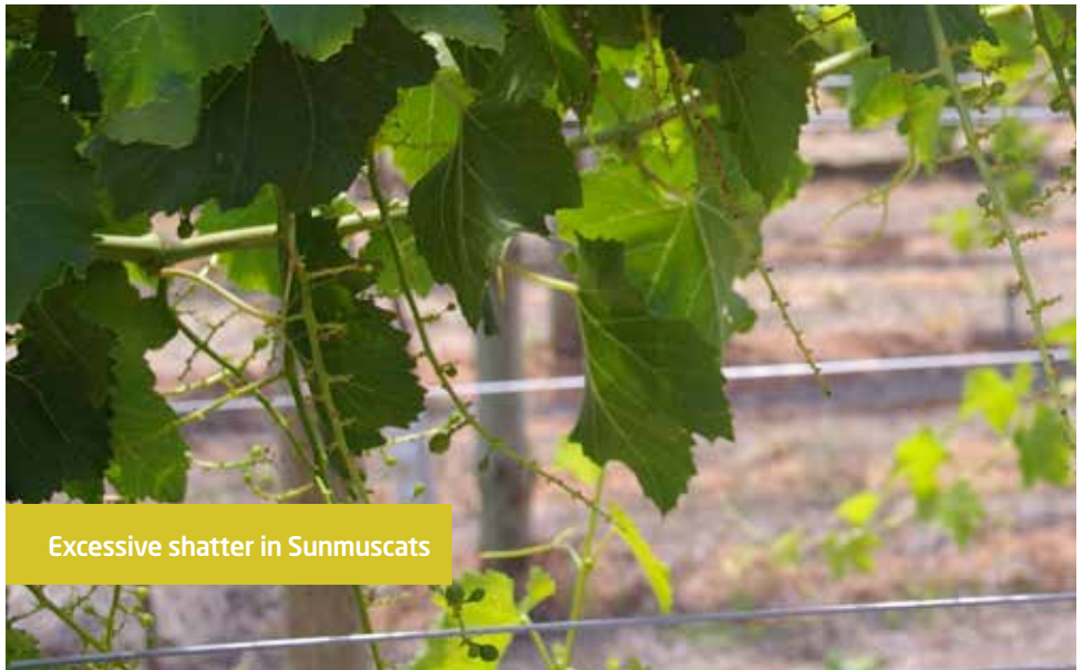
Excessive shatter in Sunmuscats

It is a fine balancing act to maintain enough moisture not to cause stress but also to prevent the 'grand flush' of overgrowth and the problems associated with it can cause.